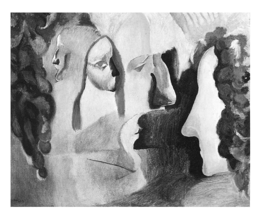
Art of Marcel Duchamp

It is actually a porcelain for a public urinal, set sideways and signed "R. Mutt, 1917'. It was rejected by the New York Independents in 1917. The authors